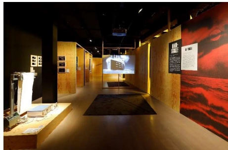
View of the exhibition, Uwe Dettmar / DFF.

1 – Amongst others: Bulfin, Ailise: Popular Culture and the “New Human Condition”: Catastrophe Narratives and Climate Change. In: Global and Planetary Change, Vol.156, 2017, S. 140-146. Salmose, Niklas: The Apocalyptic Sublime: Anthropocene Representation and Enviromental Agency in Hollywood Action-Adventure Cli Fi Films. In: The Journal of Popular Culture, Vol. 51(6), Dezember 2018, S. 1415-1433.